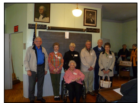
Alumni of the Branch School honored at the Ribbon Cutting.