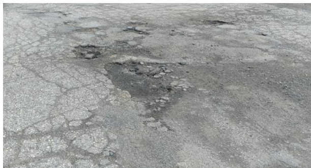
Existing Roadway Condition at Charlsfield La. (PASER rating of 1)